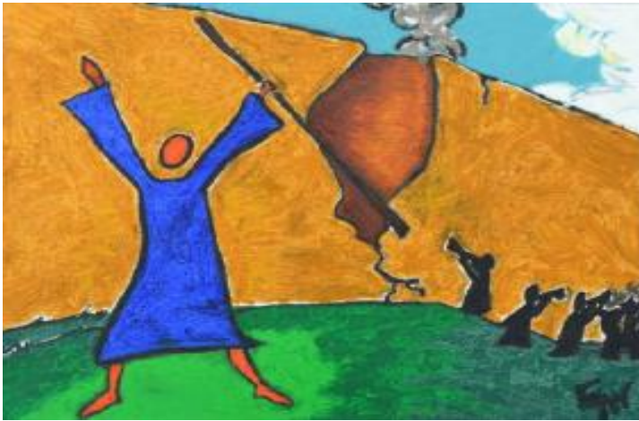
“Joshua and Jericho”